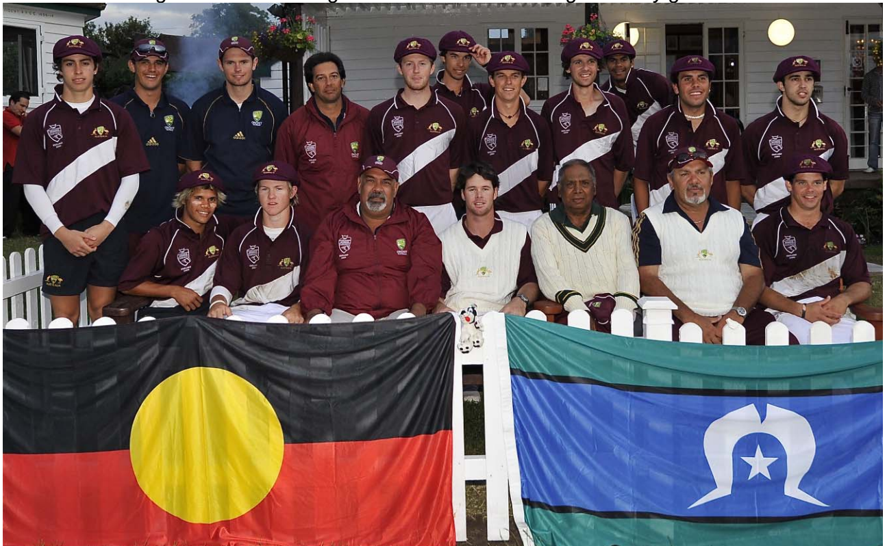
Image 4 Australian Indigenous cricket team at Reigate Priory ground